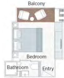
Panorama Balcony Suite