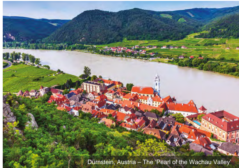
Dürnstein, Austria – The 'Pearl of the Wachau Valley'

DAY 1 Depart the USA: Depart the USA on your overnight flight to Budapest, Hungary.