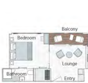
Owner's One-Bedroom Suite