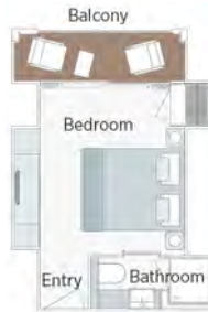
Grand Balcony Suite