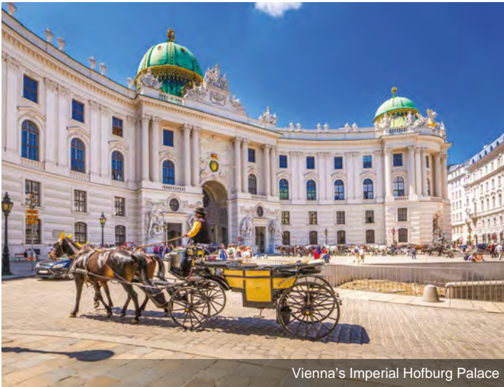
Vienna's Imperial Hofburg Palace