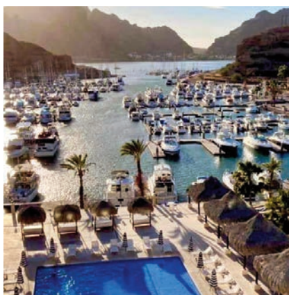
VIEW FROM OUR HOTEL IN SAN CARLOS

Morning departure from Tucson, AZ, crossing the border into Mexico at Nogales. After a short drive, we arrive at Santa Ana for lunch. From there, we are on our way to Hermosillo, where we visit the Cathedral and the Government Palace. Arrival in San Carlos Bay is by sunset at our hotel for the next two nights, the beautiful Marinaterra Resort. We will enjoy a Welcome to Mexico reception hosted by your Tour Director before dinner. (L, D)