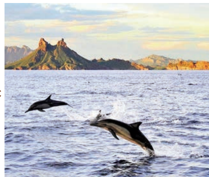
SEA OF CORTEZ CRUISE

After a relaxed breakfast at the hotel, we board a private boat for a scenic cruise on the Sea of Cortez – keep a lookout for dolphins, seals and maybe even whales, as well as exotic birds such as the blue-footed booby and the great blue heron. After we return we will visit a scenic lookout point rated by National Geographic as one of the top 10 in the world. Time to relax and visit the Marina shops this afternoon. Dinner this evening is at a local restaurant. (B, L, D)