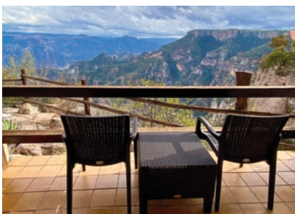
TWO NIGHT STAY IN A CANYON VIEW ROOM AT POSADA BARRANCAS

Early in morning, we transfer to the train station for the most spectacular train ride in North America! The Chihuahua al Pacifico railway, "Chepe," provides impressively unique access into Copper Canyon country and is considered one of the most scenic railroads in the world. This engineering marvel goes through 86 tunnels and over 32 bridges, passing spectacular scenes of Mexico's mountain interior. You'll quickly learn why the "Train Ride in the Sky" is one of the most dramatic railway journeys in the Western Hemisphere. Lunch onboard the train is included as we snake our way through the canyon enroute to Posada Barrancas. Your hotel for the next two nights is the spectacular Hotel Mirador where guests will have balcony views of the canyon. A Tarahumara Indian cultural presentation is planned at the hotel before dinner. (B, L, D)