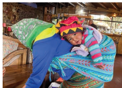
MEET THE TARAHUMARA INDIANS

Today we have a relaxing day planned to enjoy the views and watch the Tarahumara Indians weave their world famous baskets, as well as other local arts and crafts. An optional opportunity to board the new Copper Canyon aerial tramway is planned, allowing us to descend halfway into the Canyon and experience great views. This day promises to be one of the most memorable as you experience the quiet solitude of being on the rim of the remote and vast Copper Canyon. (B, L, D)