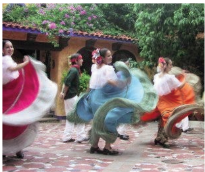
LOCAL CULTURE IN ALAMOS