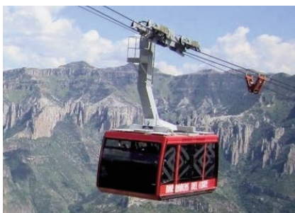
COPPER CANYON AERIAL TRAM

Today we have a relaxing day planned to enjoy the views and watch the Tarahumara Indians weave their world famous baskets, as well as other local arts and crafts. An optional opportunity to board the new Copper Canyon aerial tramway is planned, allowing us to descend halfway into the Canyon and experience great views. This day promises to be one of the most memorable as you experience the quiet solitude of being on the rim of the remote and vast Copper Canyon. (B, L, D)