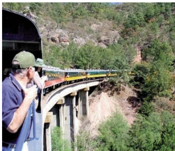
TRAIN RIDE THROUGH THE COPPER CANYON

Early in morning, we transfer to the train station for the most spectacular train ride in North America! The Chihuahua al Pacifico railway, "Chepe," provides impressively unique access into Copper Canyon country and is considered one of the most scenic railroads in the world. This engineering marvel goes through 86 tunnels and over 32 bridges, passing spectacular scenes of Mexico's mountain interior. You'll quickly learn why the "Train Ride in the Sky" is one of the most dramatic railway journeys in the Western Hemisphere. Lunch onboard the train is included as we snake our way through the canyon enroute to Posada Barrancas. Your hotel for the next two nights is the spectacular Hotel Mirador where guests will have balcony views of the canyon. A Tarahumara Indian cultural presentation is planned at the hotel before dinner. (B, L, D)