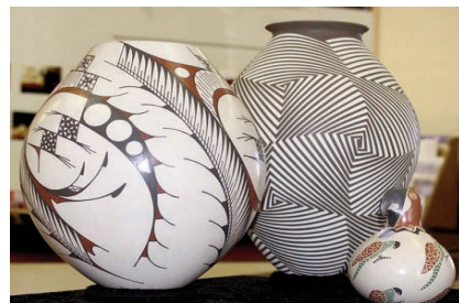
MATA ORTIZ POTTERY

After breakfast, we will enjoy a guided tour of Chihuahua, one of Mexico's most historic city centers. The city's patriotic legacy is evident while visiting the Government Palace and the Metropolitan Cathedral. After lunch, we depart for and continue our journey to Nuevo Casas Grandes. Tonight we have a Mata Ortiz pottery demonstration and our farewell dinner. (B, L, D)