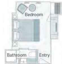
Emerald Stateroom 153ft 2 – 170ft 2