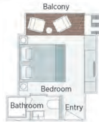
Panorama Balcony Suite 160ft 2 – 180ft 2