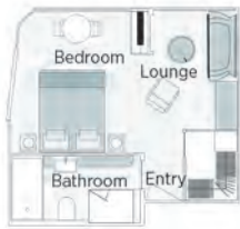
Emerald Riverview Suite 300ft 2