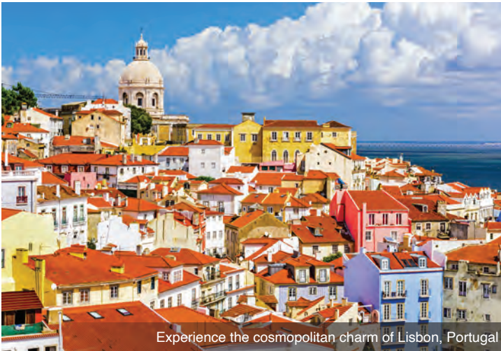
Experience the cosmopolitan charm of Lisbon, Portugal