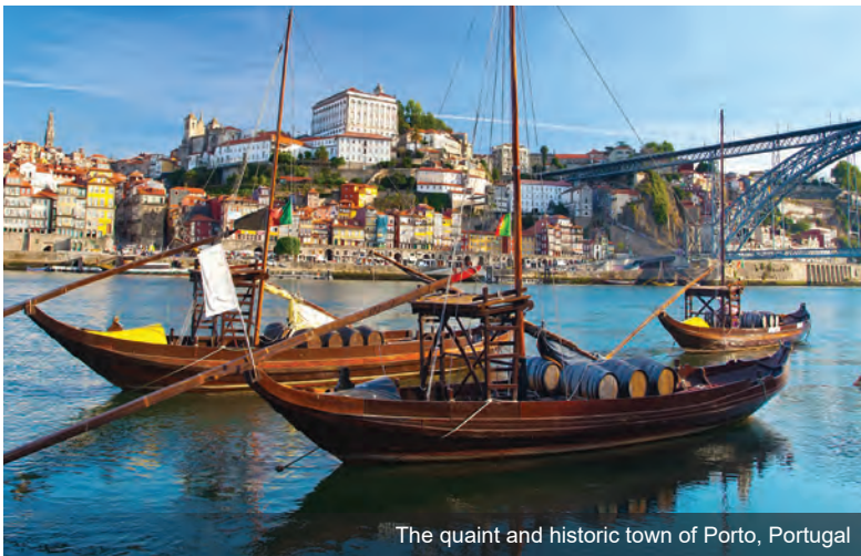
The quaint and historic town of Porto, Portugal

pilgrimage sites in Portugal. Visit the Sanctuary perched atop the hill, with its iconic 686-step granite staircase, decorated with the traditional Portuguese blue and white 'azulejos' tiles. This afternoon, experience a rural lunch at Quinta da Pacheca, one of the finest estates along the Douro River. Return to the ship in Régua after the excursion. This evening, enjoy local entertainment onboard. Meals: B, L, D