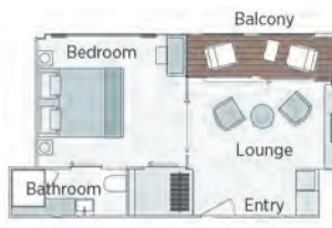
Owner's One-Bedroom Suite 285ft 2