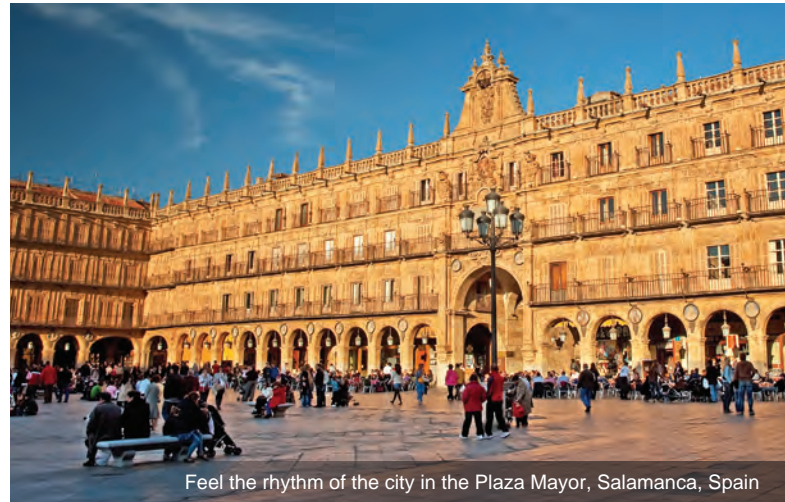
Feel the rhythm of the city in the Plaza Mayor, Salamanca, Spain

DAY 1 Depart the USA: Depart the USA on your overnight flight to Lisbon, Portugal.