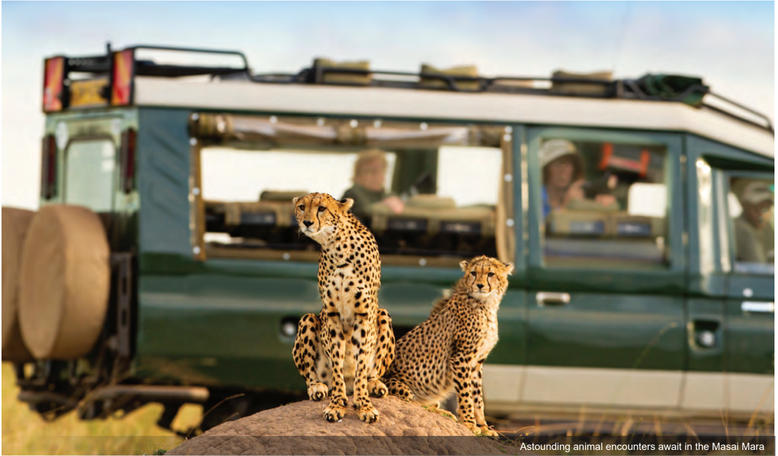
Astounding animal encounters await in the Masai Mara