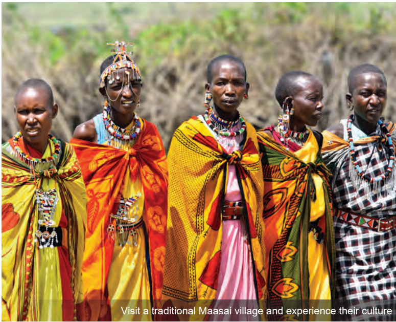
Visit a traditional Maasai village and experience their culture

Rift Valley. Relish in the surrounding sights and sounds of the native wildlife. Beautiful birds along the banks, in the trees, and soaring above; lazy hippos yawning as they emerge from the water; African Fish Eagles swoop down to snatch a fish from the lake for dinner...it all awaits! Check in to the lodge and enjoy a relaxing evening. Meals: B, L, D