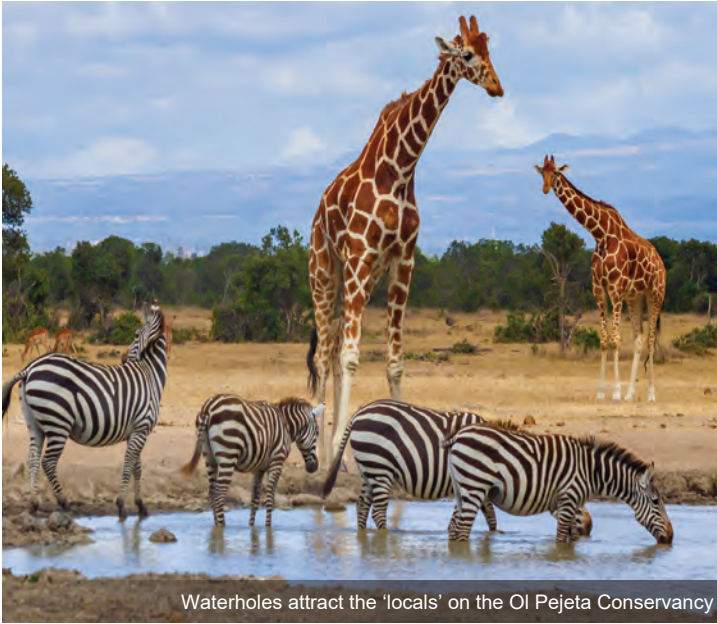
Waterholes attract the 'locals' on the OI Pejeta Conservancy