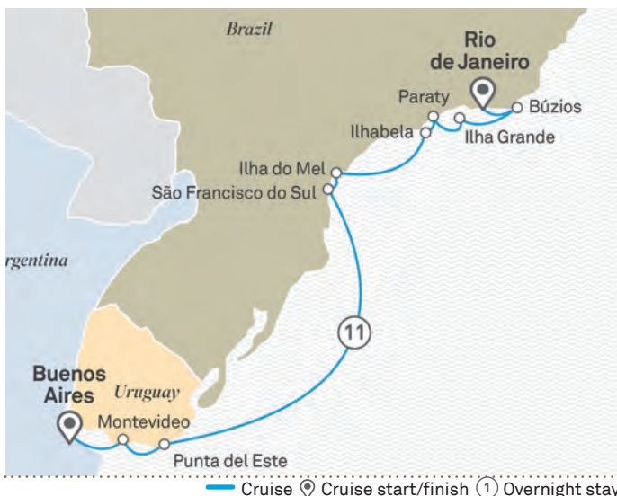
— Cruise | 📍 Cruise start/finish | ① Overnight stay

Like something from a picture book, Paraty's cobbled streets and chalk-white buildings will have you grabbing your camera. Your friends may never believe you when you tell them just how beautiful this Atlantic jewel is, so better to provide photographic proof, we say. After breakfast on board – perhaps delivered to your ultra-luxury suite for a verandah view – venture into Paraty's friendly streets to begin your day. Bold blocks of the architectural accents' primary colour set off the steeply rising mountains, veiled in swaths of emerald leaf cover. Exploring here is a discovery into nature and culture. Be certain to keep your eyes open for the iconic birds that make this area their home, including jocular toucans, kaleidoscopic parrots and flitting hummingbirds. Meals: B.L.D