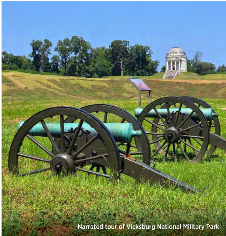
Narrated tour of Vicksburg National Military Park

At the Delta Blues Museum, learn how the Blues was born and grew up in the area thanks to musicians like Muddy Waters, John Lee Hooker, Sam Cooke and Ike Turner. It is dedicated to exploring the history and heritage of the unique American musical art form of the Blues. Enjoy an included lunch at the Morgan Freeman-owned Ground Zero Blues Club, established in 2001 to celebrate the area's rich Blues heritage. At the B.B. King Museum trace the roots of Blues music from the cotton fields and juke joints through the life of the Blues' foremost ambassador, Riley B.B. King. Meals: B, L