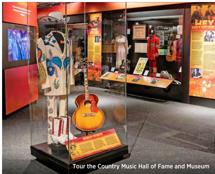
Tour the Country Music Hall of Fame and Museum

Begin your musical adventure with a narrated driving tour of Nashville. See the Honkey Tonks, Music Row, a full-scale replica of the Parthenon and visit the Ryman Auditorium. Then tour the Country Music Hall of Fame and Museum, called the "Smithsonian of Country Music" because of its collection of artists' artifacts, photographs, recorded sound and vintage video.