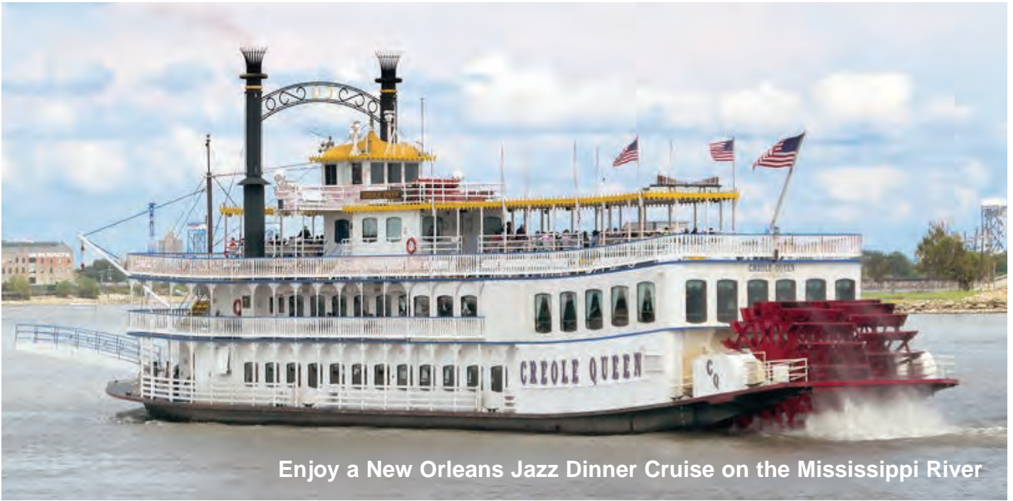
Enjoy a New Orleans Jazz Dinner Cruise on the Mississippi River