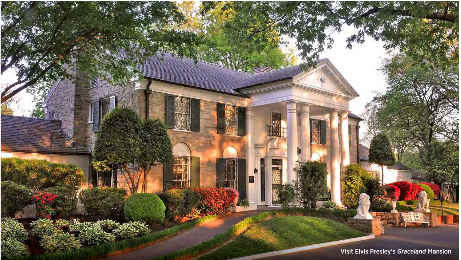
Visit Elvis Presley's Graceland Mansion