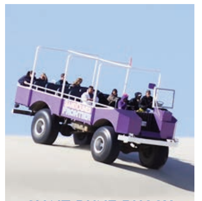
GIANT DUNE BUGGY RIDE AT THE OREGON DUNES

Bordering on both the Pacific Ocean and the large Yaquina Bay, Newport is so many things combined into one remarkable place. An active working waterfront, the Historical Bayfront area is home to one of Oregon's largest commercial fishing fleets. It is also an intriguing cultural district, with shops, art galleries, chowder houses, and restaurants. You'll spend the day getting to know what makes Newport such a special place to visit. Newport has not one but two lighthouses — the original lighthouse on Yaquina Bay, and a second lighthouse built in the late 1800s on Yaquina Head, north of town. At 93 feet tall, the Yaquina Head Lighthouse is the tallest active lighthouse in Oregon. You'll have time to explore the lighthouse interpretive center, do a little shopping and grab a bowl of chowder and a local beer at one of the restaurants in town. Later in the afternoon you'll board the 65' Marine Discovery vessel for a fun and fascinating sea life cruise. A marine naturalist will introduce you to the variety of sea life including gray whales, harbor porpoise, seals, sea lions, pelicans, bald eagles, and an abundance of marine birds. Dinner is on your own tonight, followed by s'mores at sunset on the patio at the Elizabeth Oceanfront Suites. (BREAKFAST AND DESSERT)