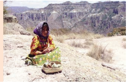
HOME OF THE TARAHUMARA INDIANS