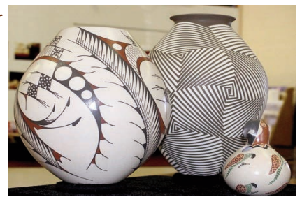
MATA ORTIZ POTTERY

Breakfast is included at the hotel. Depart for Copper Canyon. Just over the border, we will stop for lunch in Puerto Palomas. Travel through the Chihuahuan Desert to reach the city of Nuevo Casas Grandes. Visit México's northernmost archeological site at Paquimé, where the ancient Gran Chichimeca civilization once thrived. Tonight we have a Mata Ortiz pottery demonstration and our welcome dinner. (B,L, D)