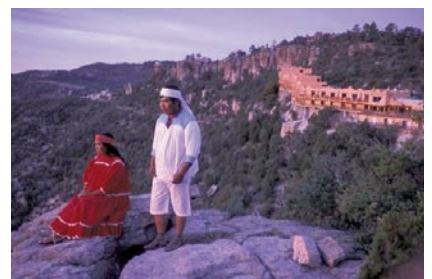
TARAHUMARA INDIANS AT POSADA BARRANCAS

Today we have a relaxing day planned to enjoy the views and watch the Tarahumara Indian weave their world famous baskets, as well as other local arts and crafts. An optional opportunity to board the new Copper Canyon aerial tramway is planned, allowing us to descend halfway into the Canyons and experience great views. This day promises to be one of the most memorable as you experience the quiet solitude of being on the rim of the remote and vast Copper Canyon. (B, L, D)