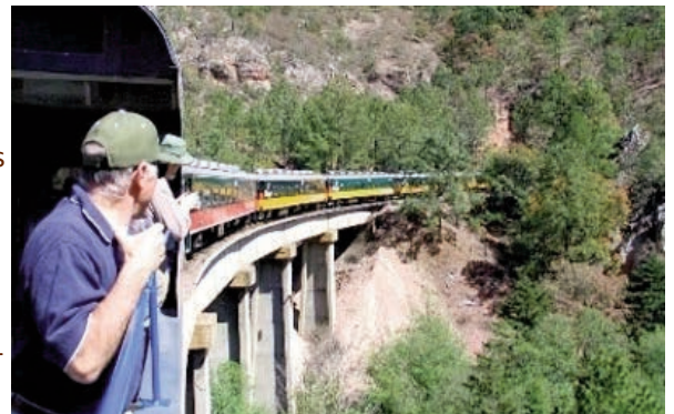
TRAIN RIDE THROUGH THE COPPER CANYON

After breakfast overlooking the canyon, we'll transfer to the train station, as the conductors calls for "all aboard" at 9:00am. The Chihuahua al Pacifico railway, "Chepe," provides impressively unique access into Copper Canyon country and is considered one of the most scenic railroads in the world. On its 420 mile run, this engineering marvel goes through 86 tunnels and over 32 bridges, passing spectacular scenes of Mexico's mountain interior, the Pacific coast, and every type of landscape in between. The "Train Ride in the Sky" is one of the most dramatic railway journeys in the Western Hemisphere. Lunch onboard the train is included as we snake our way through the spectacular Copper Canyon enroute to El Fuerte. We arrive in El Fuerte by mid-afternoon where we'll check in to our hotel located in the heart of this charming city. This evening, immerse yourself in the local culture with folk dancing by performers in traditional costumes. (B, L, D)