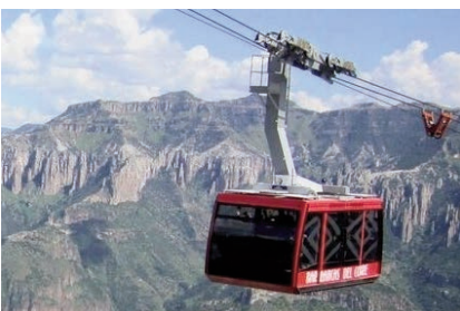
COPPER CANYON AERIAL TRAM

Today we have a relaxing day planned to enjoy the views and watch the Tarahumara Indian weave their world famous baskets, as well as other local arts and crafts. An optional opportunity to board the new Copper Canyon aerial tramway is planned, allowing us to descend halfway into the Canyons and experience great views. This day promises to be one of the most memorable as you experience the quiet solitude of being on the rim of the remote and vast Copper Canyon. (B, L, D)