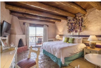
TWO NIGHT STAY IN A CANYON VIEW ROOM AT POSADA BARRANCAS

This morning after breakfast, we will leave the high planes of the Chihuahuan Desert and head for the Sierra Madre Mountains, home of the reclusive Tarahumara (Raramuri) people. Travel through Creel and over the Continental Divide along the way. As we gain altitude, you will see the landscape changing from rolling hills into rugged mountains. Arrive at Posada Barrancas where we will be checking in for a two night stay at this spectacular location overlooking the Copper Canyon. You'll enjoy a short nature walk around the canyon rim and a presentation about the Tarahumara culture. Dinner is included in the hotel's dining room where floor to ceiling windows offer one of the most incredible views. (B, L, D)