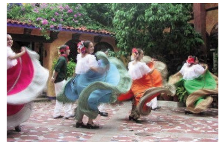
LOCAL CULTURE IN ALAMOS

We will depart El Fuerte after breakfast, stopping in route for a home-hosted lunch in Navajoa before continuing on to the quaint city of Álamos. A living museum, the city cobblestones streets are lined with beautiful Spanish Colonial Mansions. This evening immerse yourself in the local culture at dinner with a colorful spectacle of music and folk dancing by performers in traditional costumes. (B, L, D)