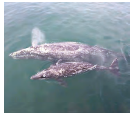
PACIFIC GRAY WHALES

Early this morning, we will depart for Guerrero Negro's nearby lagoon, Ojo de la Liebre. The lagoons serve as the magnificent Gray Whale's first calving stop on the journey from the Bering Strait. Aboard small, non-intrusive boats, captained by local guides, you will experience an up-close encounter with these gentle and curious giants. Afterward, lunch is included at a local restaurant after today's excursion before returning to the hotel. The remainder of the afternoon and evening are at your leisure. (B, L)