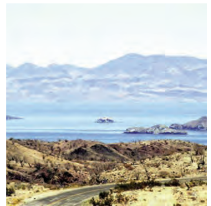
SAN QUINTIN, BAJA CALIFORNIA

Depart this morning for Northern Baja California, Mexico. Bienvenidos! We will cross the border at Tijuana, the world's busiest land border crossing. Visit Tijuana's bustling Mercado Hidalgo before continuing on scenic Highway 1 to Ensenada for lunch at a local restaurant. After lunch, we will return to Highway 1, traveling south through Northern Baja's tomato, strawberry and pepper fields on our way to San Quintin and tonight's Welcome Dinner. (B, L, D)