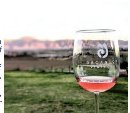
FAREWELL DINNER AT A WINERY IN THE GUADALUPE VALLEY

Today, after breakfast, you will have your choice to either relax and explore more of Ensenada, or take a side trip to La Bufadora, a local attraction and one of the largest natural ocean geysers in North America. Later in the afternoon, we'll continue to the heart of Mexico's premier wine country, the Guadalupe Valley, which has wineries that nowadays rival those of Napa Valley and other prominent wine regions. Here, we will visit a locally owned and operated winery for tastings and our Farewell Dinner. (B, D)