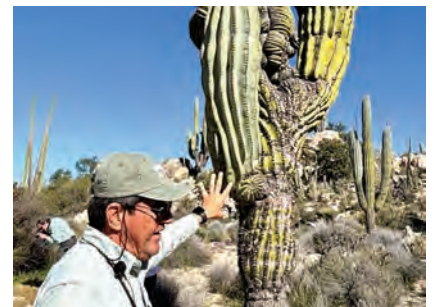
DESERT NATURE WALK IN CATAVINA

After breakfast, we will continue driving south on Highway 1 to Guerrero Negro, Baja California Sur, through the Desierto Central de Baja California which is rich with unique vegetation. We will stop in Catavina along the way to take a short walk through this fascinating desert with rock formations, granite boulders and cave paintings that offer a glimpse into the indigenous human and animal life that once populated the region. After lunch at a local restaurant, we will continue to Guerrero Negro, which will serve as base camp for our next day's whale watching experience. Dinner this evening is included at the hotel. (B, L, D)