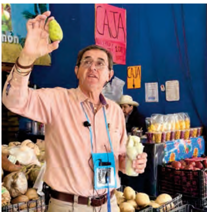
MERCADO HIDALGO IN TIJUANA

Travel across the border to Baja California and San Quintin