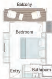
Grand Balcony Suite 207ft² – 210ft²