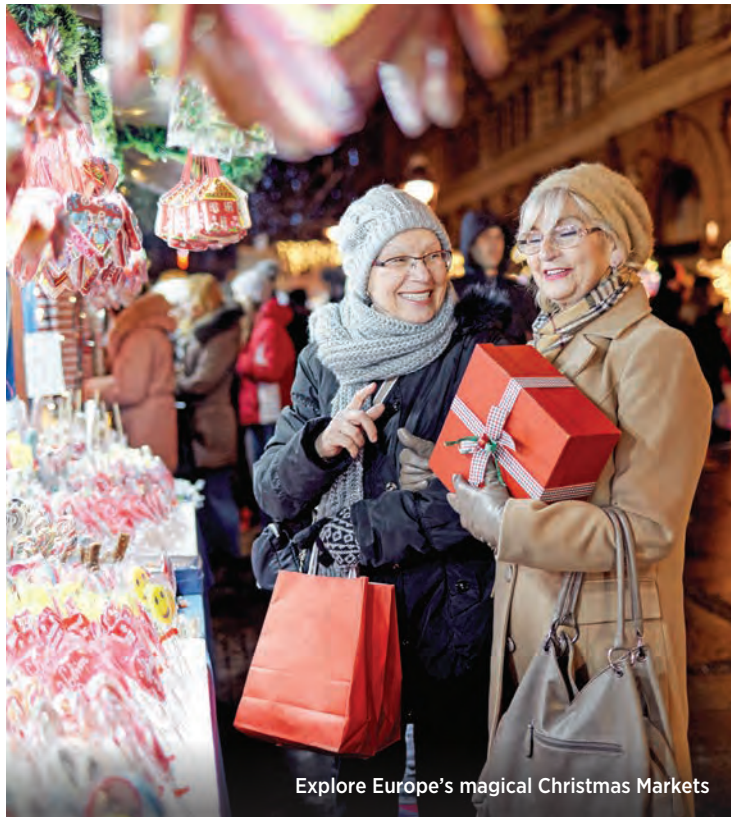
Explore Europe's magical Christmas Markets