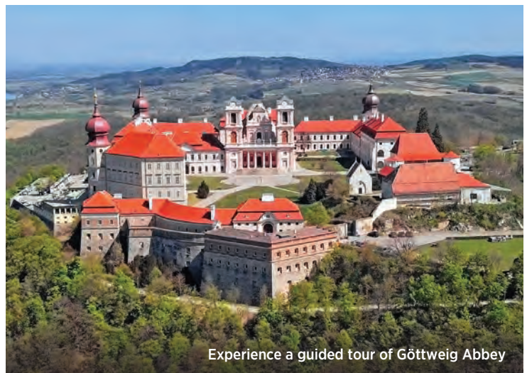
Experience a guided tour of Götweig Abbey