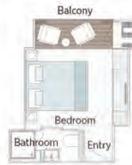
Emerald Panorama Balcony Suite 160ft² – 189ft²