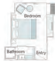
Emerald Stateroom 153ft² – 170ft²