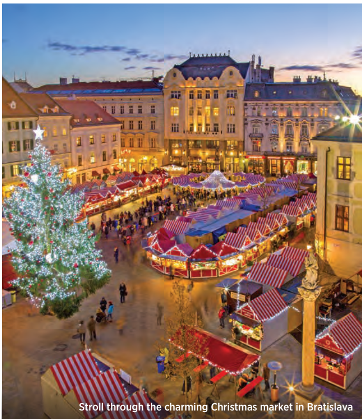
Stroll through the charming Christmas market in Bratislava