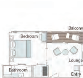
Owner's One-Bedroom Suite 285ft² – 315ft²