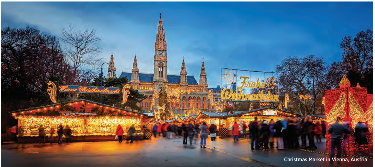
Christmas Market in Vienna, Austria