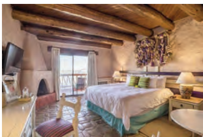
TWO NIGHT STAY IN A CANYON VIEW ROOM AT POSADA BARRANCAS

Travel to the city of Chihuahua, the capital of the state and an important center of Mexico's revolutionary history. Arrive in the afternoon and enjoy a guided tour of the historic downtown Centro Histórico, including the Plaza de Armas, the Cathedral of Chihuahua, and the State Capitol building, where striking murals vividly portray the region's rich past. (B, D)