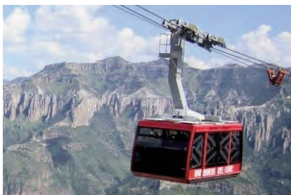
COPPER CANYON AERIAL TRAM

This morning after breakfast, we will leave the high planes of the Chihuahuan Desert and head for the Sierra Madre Mountains, home of the reclusive Tarahumara (Raramuri) people. Travel through Creel and over the Continental Divide along the way. As we gain altitude, you will see the landscape changing from rolling hills into rugged mountains. Arrive at Posada Barrancas where we will be checking in for a two night stay at this spectacular location overlooking the Copper Canyon. You'll enjoy a short nature walk around the canyon rim and a presentation about the Tarahumara culture. Dinner is included in the hotel's dining room where floor to ceiling windows offer one of the most incredible views. (B, L, D)