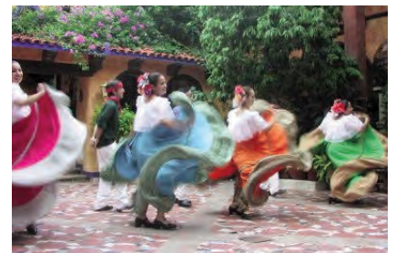
LOCAL CULTURE IN ALAMOS

We will depart El Fuerte after breakfast, stopping in route for a home-hosted lunch in Navajoa before continuing on to the quaint city of Álamos. A living museum, the city cobblestones streets are lined with beautiful Spanish Colonial Mansions. This evening immerse yourself in the local culture at dinner with a colorful spectacle of music and folk dancing by performers in traditional costumes. (B, L, D)