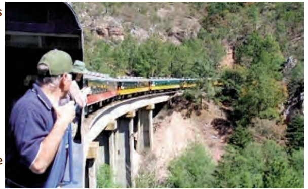
TRAIN RIDE THROUGH THE COPPER CANYON

After breakfast overlooking the canyon, we'll transfer to the train station, as the conductors calls for "all aboard" at 9:00am. The Chihuahua al Pacifico railway, "Chepe," provides impressively unique access into Copper Canyon country and is considered one of the most scenic railroads in the world. On its 420 mile run, this engineering marvel goes through 86 tunnels and over 32 bridges, passing spectacular scenes of Mexico's mountain interior, the Pacific coast, and every type of landscape in between. The "Train Ride in the Sky" is one of the most dramatic railway journeys in the Western Hemisphere. Lunch onboard the train is included as we snake our way through the spectacular Copper Canyon enroute to El Fuerte. We arrive in El Fuerte by mid-afternoon where we'll check in to our hotel located in the heart of this charming city. This evening, immerse yourself in the local culture with folk dancing by performers in traditional costumes. (B, L, D)