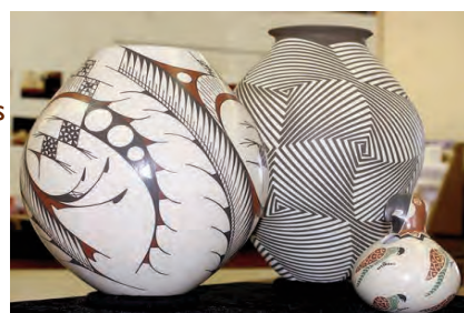
MATA ORTIZ POTTERY

Breakfast is included at the hotel. Depart for Copper Canyon. Just over the border, we will stop for lunch in Puerto Palomas. Travel through the Chihuahuan Desert to reach the city of Nuevo Casas Grandes. Visit México's northernmost archeological site at Paquimé, where the ancient Gran Chichimeca civilization once thrived. Tonight we have a Mata Ortiz pottery demonstration and our welcome dinner. (B, L, D)