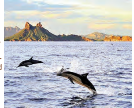
SEA OF CORTEZ CRUISE

After a relaxed breakfast, we board a private boat for a scenic cruise on the Sea of Cortez. Keep a lookout for dolphins, seals, and exotic birds such as the blue-footed booby and the magnificent frigatebird. This morning we will also visit the Guaymas Pearl Farm, the first cultured pearl farm in the Americas. Here you will learn about pearl farming, pearl grading, and quality selection. Afterward, we will visit the Mirador Escénico en route back to the hotel. The Mirador is rated by National Geographic as one of the top ten ocean views in the world. Lunch at the hotel with time to relax and visit the Marina shops. One more dinner in Mexico is included this evening at the hotel as we share photos and memories of our Copper Canyon experience. (B, L, D)