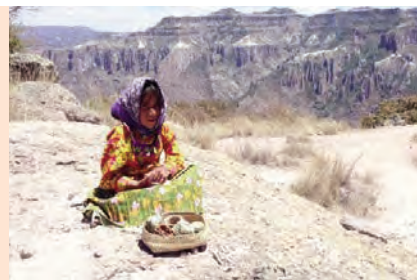
HOME OF THE TARAHUMARA INDIANS