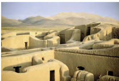
UNESCO WORLD HERITAGE SITE PAQUIME

Breakfast is included at the hotel. Depart for Copper Canyon. Just over the border, we will stop for lunch in Puerto Palomas. Travel through the Chihuahuan Desert to reach the city of Nuevo Casas Grandes. Visit México's northernmost archeological site at Paquimé, where the ancient Gran Chichimeca civilization once thrived. Tonight we have a Mata Ortiz pottery demonstration and our welcome dinner. (B, L, D)