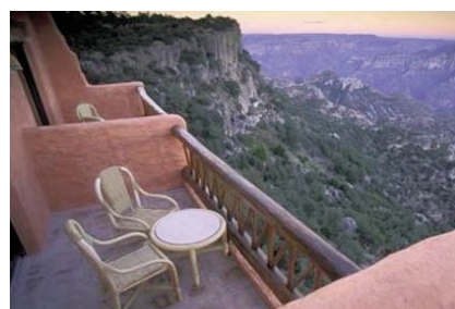
TWO NIGHT STAY IN A CANYON VIEW ROOM AT POSADA BARRANCAS

This morning after breakfast, we will leave the high planes of the Chihuahuan Desert and head for the Sierra Madre Mountains, home of the reclusive Tarahumara (Raramuri) people. Along the way, we'll stop in the Mennonite communities and enjoy lunch in the city of Cuatemoc. We then continue our scenic ascent into the mountains, traveling through Creel before arriving at Posada Barrancas in the afternoon. We will check in for two nights at the breathtaking Hotel Mirador, perched dramatically on the canyon rim. This evening you'll enjoy dinner overlooking the canyon and a fascinating Tarahumara cultural presentation. (B, L, D)