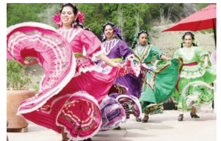
LOCAL CULTURE IN ALAMOS

We will depart El Fuerte after breakfast, stopping enroute for a home-hosted lunch in Navajoa before continuing on to the quaint city of Álamos. A living museum, the city’s cobblestones streets are lined with beautiful Spanish Colonial mansions. This evening immerse yourself in the local culture at dinner with a colorful spectacle of music and folk dancing by performers in traditional costumes. (B, L, D)