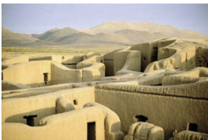
UNESCO WORLD HERITAGE SITE PAQUIME

Enjoy breakfast at the hotel before departing to visit Paquime (Casas Grandes), Mexico's northernmost major archaeological site, where the ancient Grand Chichimeca civilization built distinctive truncated pyramids and multi-story adobe apartment complexes. We then travel south toward the city of Chihuahua, stopping along the way for lunch and to learn about the region's rich frontier history, including the Apache warriors who once traversed this land. Upon arrival in Chihuahua, check in at the Courtyard by Marriott. This evening, enjoy dinner at a local restaurant showcasing regional Chihuahua cuisine. (B, L, D)