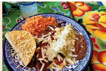
HOME OF THE TARAHUMARA INDIANS