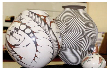
MATA ORTIZ POTTERY