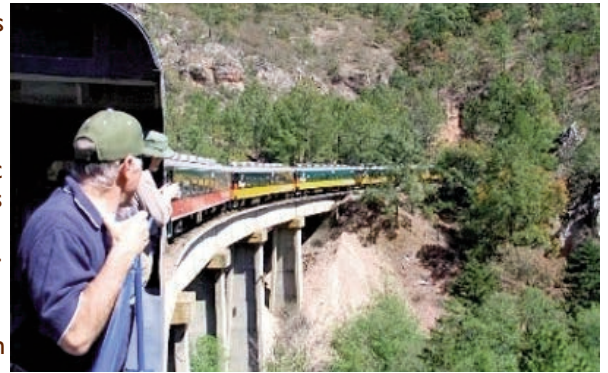
TRAIN RIDE THROUGH THE COPPER CANYON

After breakfast overlooking the canyon, we'll transfer to the train station, as the conductors calls for “all aboard” the Chihuahua al Pacifico railway, “Chepe,” provides impressively unique access into Copper Canyon country and is considered one of the most scenic railroads in the world. On its 420 mile run, this engineering marvel goes through 86 tunnels and over 32 bridges, passing spectacular scenes of Mexico’s mountain interior, the Pacific coast, and every type of landscape in between. The “Train Ride in the Sky” is one of the most dramatic railway journeys in the Western Hemisphere. Lunch onboard the train is included as we snake our way through the spectacular Copper Canyon enroute to the colonial river town of El Fuerte. Here we'll check in to the historic Posada del Hidalgo located in the heart of this charming city. This evening, immerse yourself in the local culture with dinner and entertainment. (B, L, D)