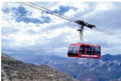
COPPER CANYON AERIAL TRAM

Free day and Aerial Tram Ride over the Copper Canyon