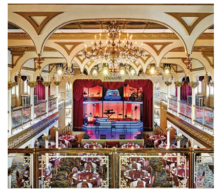
DAY 4: WEDNESDAY, NOVEMBER 20, 2024 Country Music Hall of Fame and Free time at the Opryland Resort