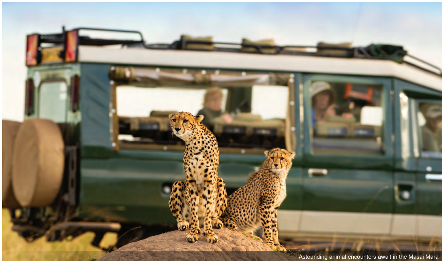
Astounding animal encounters await in the Masai Mara