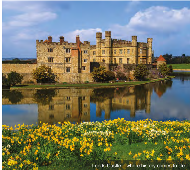
Leeds Castle – where history comes to life

DAY 1 Depart the USA: Depart the USA on your overnight flight to London, England.