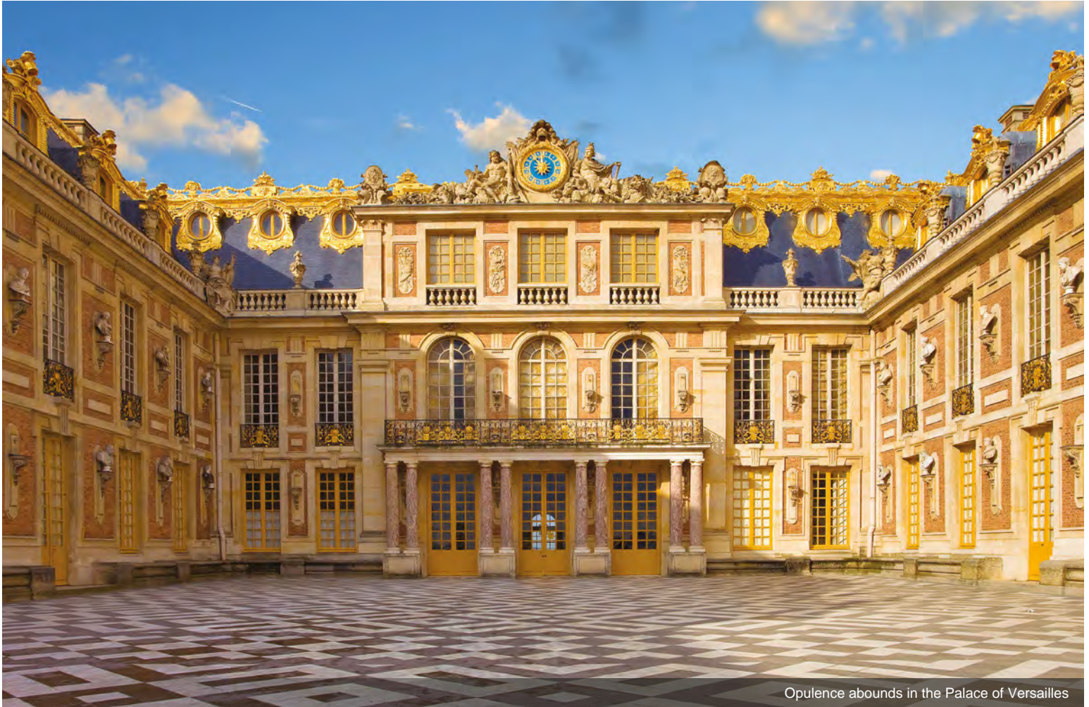
Opulence abounds in the Palace of Versailles

Double occupancy: $4,099 per person Single occupancy: $5,698 per person