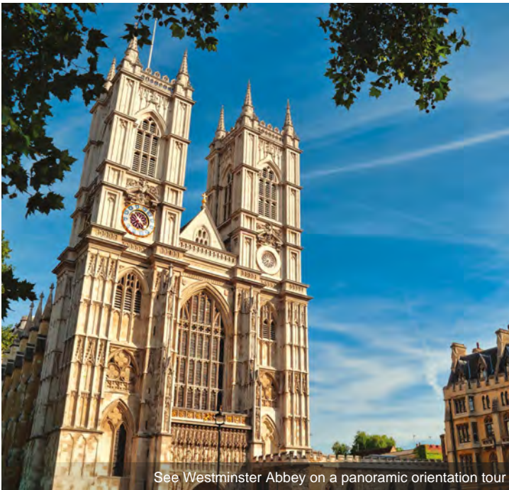
See Westminster Abbey on a panoramic orientation tour