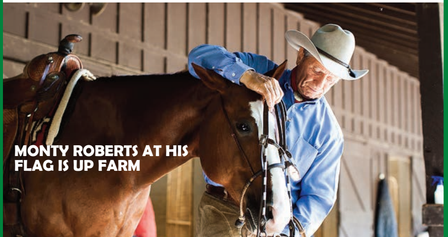
MONTY ROBERTS AT HIS FLAG IS UP FARM