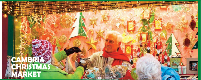
CAMBRIA CHRISTMAS MARKET