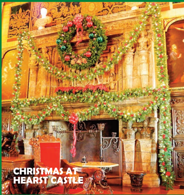
CHRISTMAS AT HEARST CASTLE